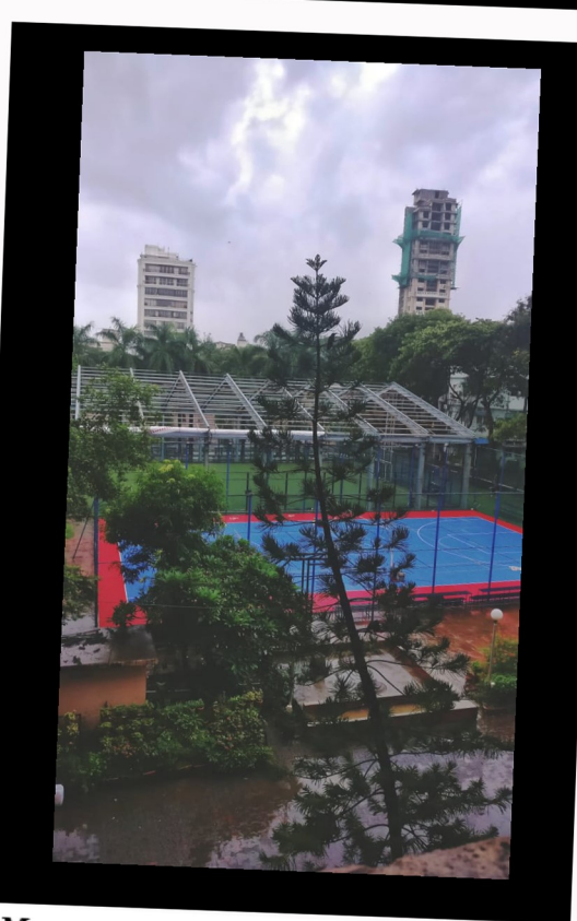
Monsoon Bringing Out True Colours of the Multi-purpose Court at ICT Prathamesh Jiwatode