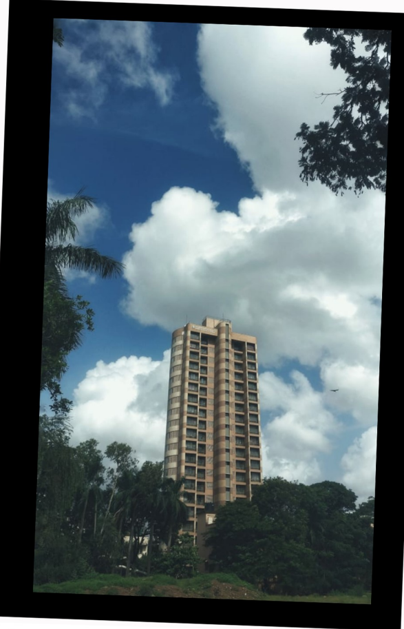
Massive Clouds in the Backdrop of Gunwanti & Kapoor Tower